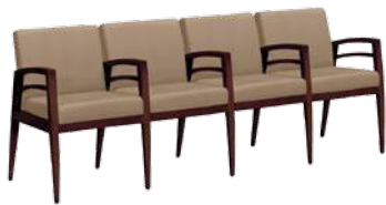
FOUR-SEAT GANGED UNIT 87½"W x 24¼"D x 33¼"H