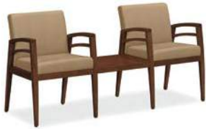
TWO-SEAT GANGED UNIT WITH CENTER TABLE 68¾"W x 24¼"D x 33¼"H