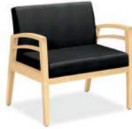
STAND ALONE BARIATRIC CHAIR 34"W x 26½"D x 33½"H