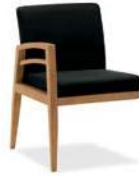
SINGLE ENDLINE GANGING CHAIR 21½"W x 24¼"D x 33¼"H