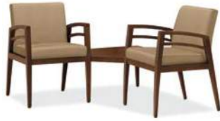
TWO-SEAT GANGED UNIT WITH CORNER TABLE 51"W x 51"D x 33¼"H