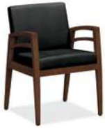
STAND ALONE GUEST CHAIR 23"W x 24½"D x 33¼"H

Plan your seating arrangement around your needs and existing architecture with a combination of straight rows of seating, stand-alone chairs, and corner and center tables.