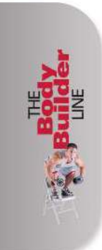
MODEL 1304 SHOWN