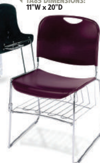
MODEL 8508 W/TAB5R AND BR85 The 8500 Series chair with the optional R/L Tablet and Book Rack