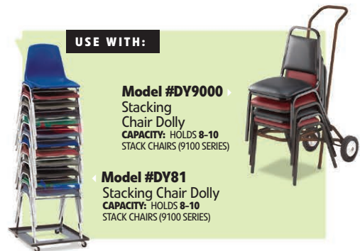
Model #DY9000 Stacking Chair Dolly CAPACITY: HOLDS 8-10 STACK CHAIRS (9100 SERIES)