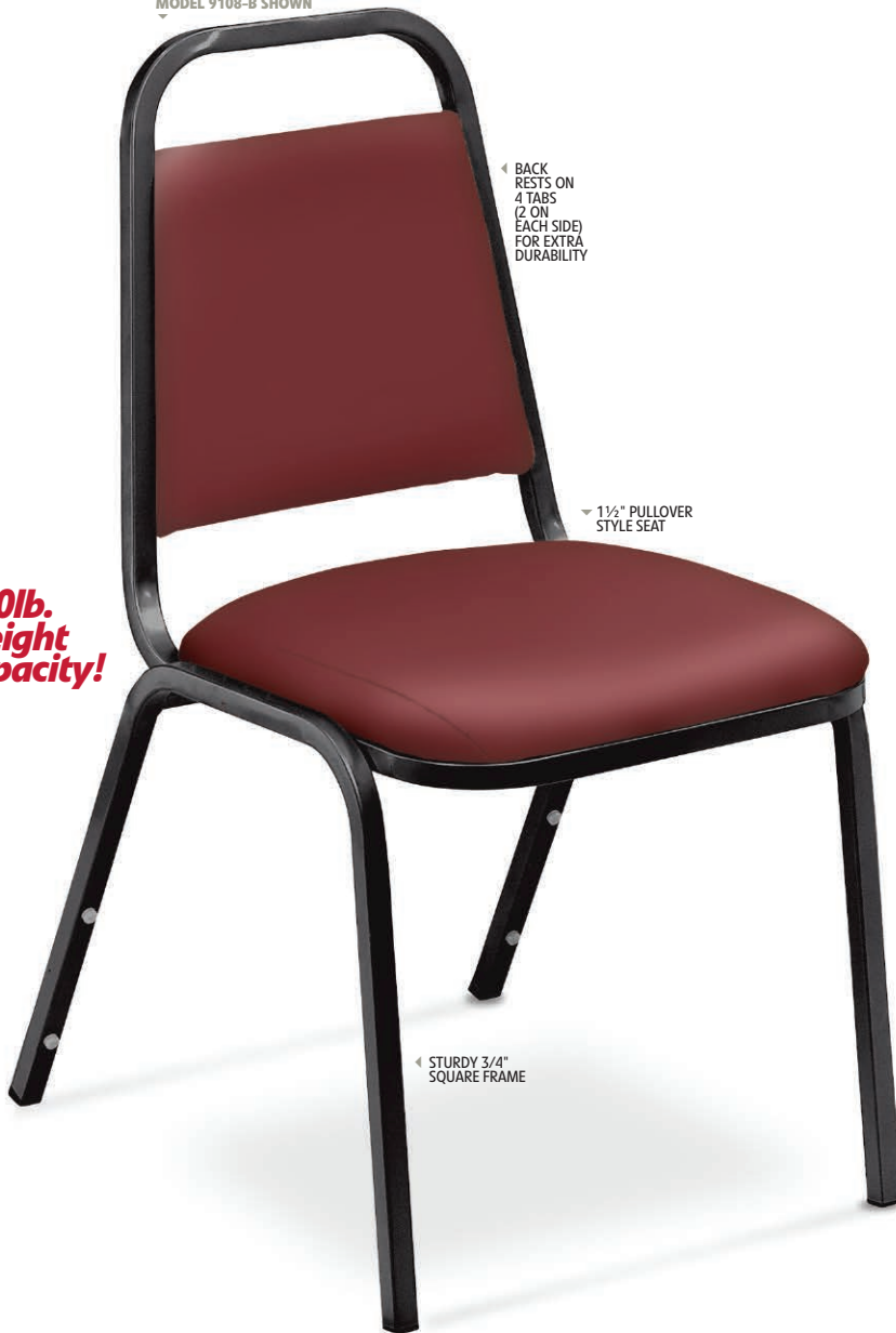
MODEL 9108-B SHOWN

BACK RESTS ON 4 TABS (2 ON EACH SIDE) FOR EXTRA DURABILITY