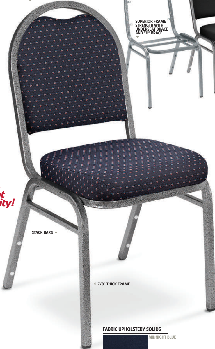
MODEL 9264-SV SHOWN

SUPERIOR FRAME STRENGTH WITH UNDERSEAT BRACE AND "H" BRACE