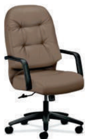
HIGH-BACK CHAIR FEATURES MEMORY FOAM