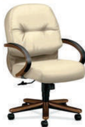
MID-BACK CHAIR FEATURES MEMORY FOAM