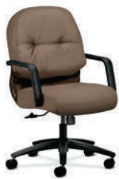
MID-BACK CHAIR FEATURES MEMORY FOAM