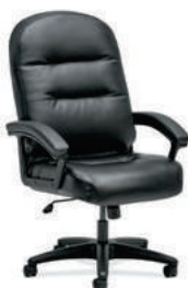
HIGH-BACK CHAIR (Limited fabrics only)