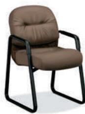
SLED BASE GUEST CHAIR