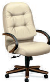
HIGH-BACK CHAIR FEATURES MEMORY FOAM