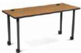
POST LEG Sturdy and affordable (glides or casters)

Time is money, and space is serious overhead. Huddle multi-purpose tables work with you to make the most of both. Tables are available with a choice of top shapes (rectangular or half-round) and bases (post legs, T-legs, or nesting bases). With a variety of options to choose from, you can specify Huddle tables that are easy to set up and easy to rearrange.