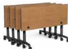
NESTING BASE Space-efficient storage (casters only)