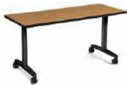
T-LEG Unobstructed leg room (glides or casters)