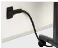
POWER ENTRY CABLE