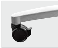
NESTING BASE/ T-LEG CASTER