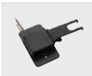
POWER ENTRY PLATE