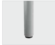
POST LEG GLIDE