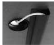
WIRE MANAGEMENT STRIPS